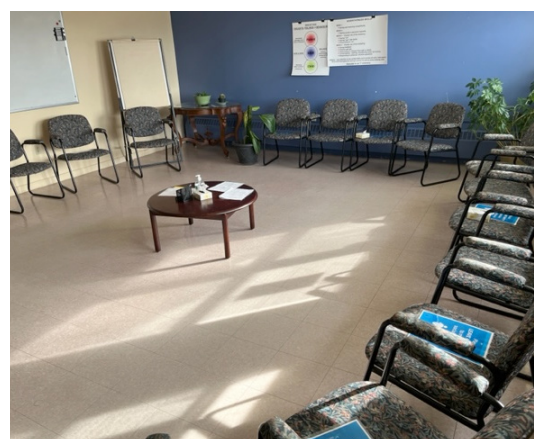
DaRT program group room.

An appropriate physical location is foundational and imperative for creating a therapeutic milieu for our patients that will support and enhance progress toward treatment goals, personal growth, and positive change.