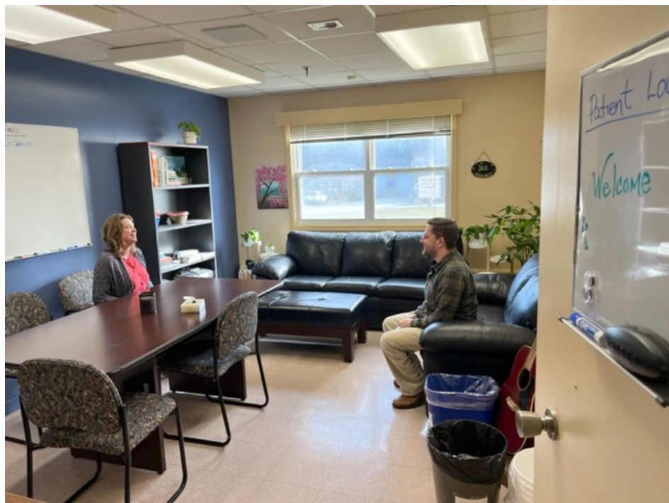
DaRT program patient lounge.

The therapeutic environment is commonly acknowledged as a significant influence on treatment experiences and outcomes. Patients with complex mental illness have unique psychological needs that require a safe environment to engage and benefit from treatment. Our therapeutic milieu (operating within the treatment groups in addition to more informal aspects of the program) is essential in providing a safe and contained setting. It is by way of this milieu and other program components that our patients can create the internal sense of belonging and trust (safety and support) necessary to engage in intensive emotion-focused and attachment-based work. Patients are encouraged to interact with group members and use what they have learned to obtain a significant clinical impact on themselves. New skills are